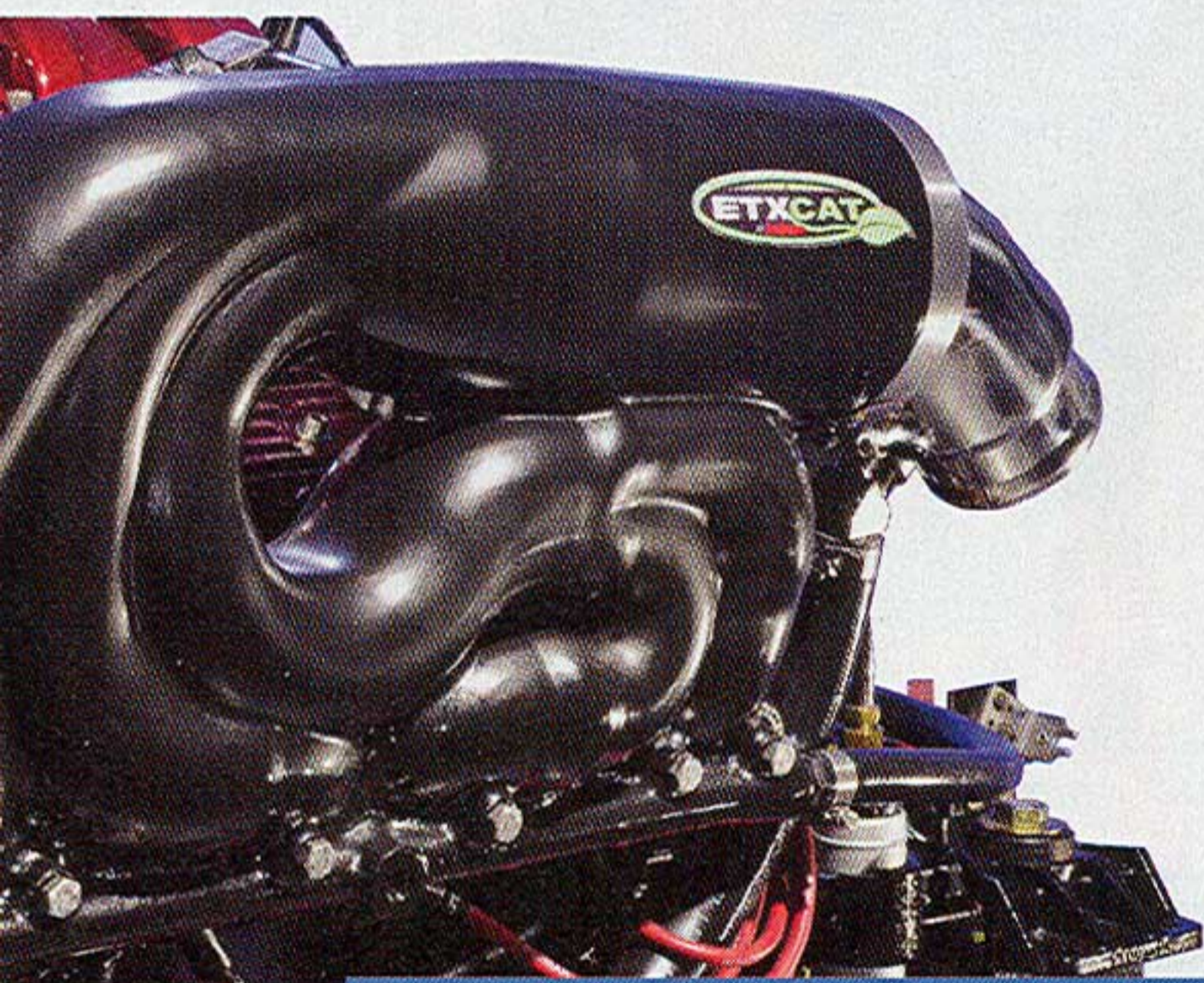
GREEN MACHINE: Low emissions, high horsepower.

The Indmar ETX/Cat engines are the first marine engines to earn the California Air Resources Board's top rating of Four Star Super-Ultra Low Emissions. This is the direct result of Indmar's heavy investment in a proprietary emissions laboratory with dyno stations, sensors and computers. Best of all, the ETX/Cat doesn't reduce the horsepower at all. That efficiency is the result of a free-breathing, header-style, high performance exhaust manifold. The catalytic converter is entirely enclosed within that manifold, so the system is simple and efficient. www.indmar.com