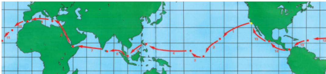
The route was drawn up to stay close to the equator, and pass through the world's great canals.

The vessel has a 14-foot, 6-inch beam, a displacement of 50,000